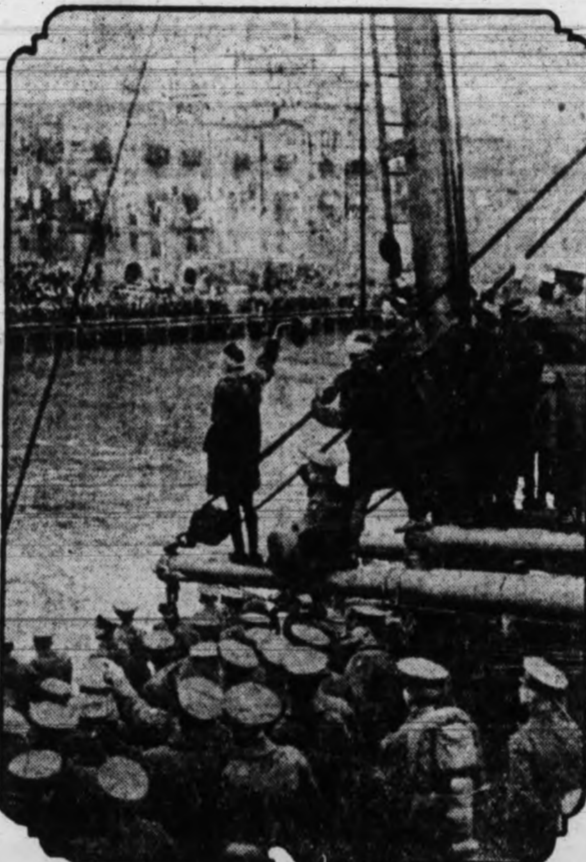
Thousands of spectators lined the banks of Savannah Harbor when the U. S. transport St. Mihiel arrived with the last contingent of doughboys from the Rhine.